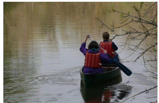
Beginner Paddlers at the 2009 Yee-Haw River Paddle

Sponsorships of $250 and $500 are available and include recognition on all printed materials, on our website, and in the media coverage of the event. Booths at the post-paddle party, are also available to sponsors. If you are willing to serve as a sponsor for this year's event, please email info@thehaw.org or call (336)-229-2229.